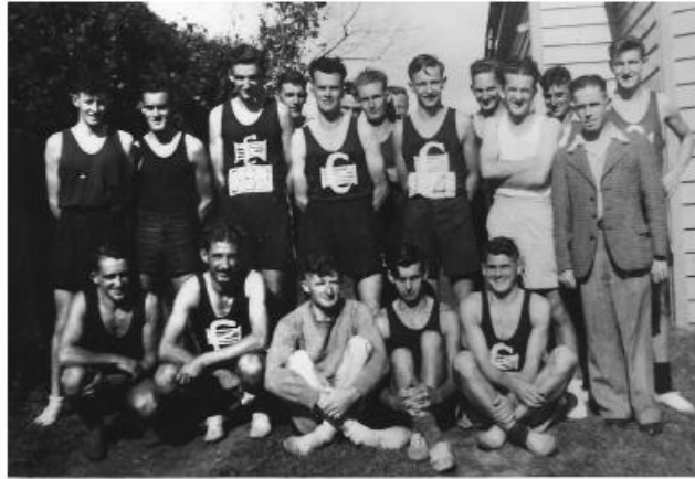
From the 1940s

in letters approximately two inches high across the top of the singlet with the club monogram of a barred gate superimposed with a capital C, again in white, underneath the lettering.