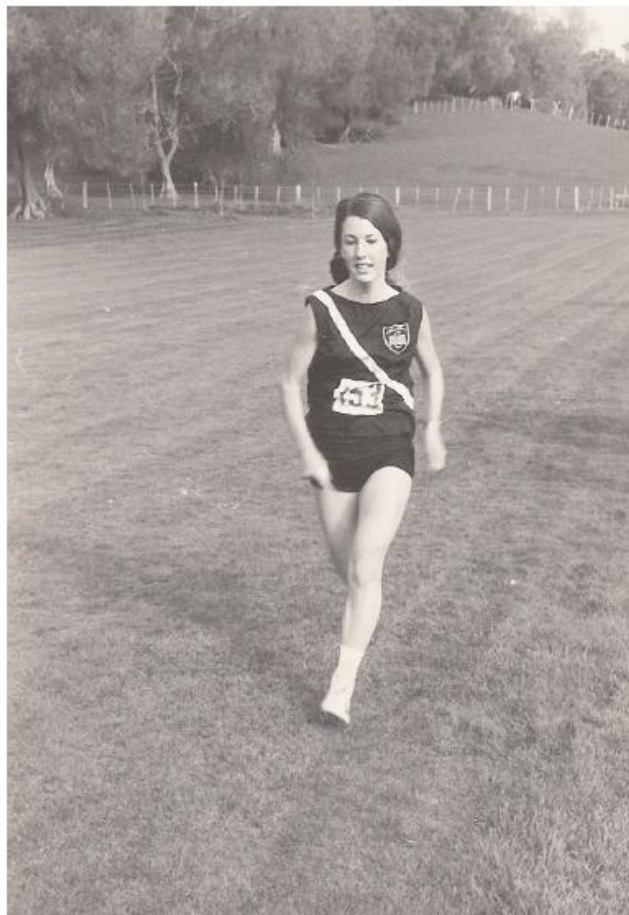
Auckland cross-country champs, early 1970's